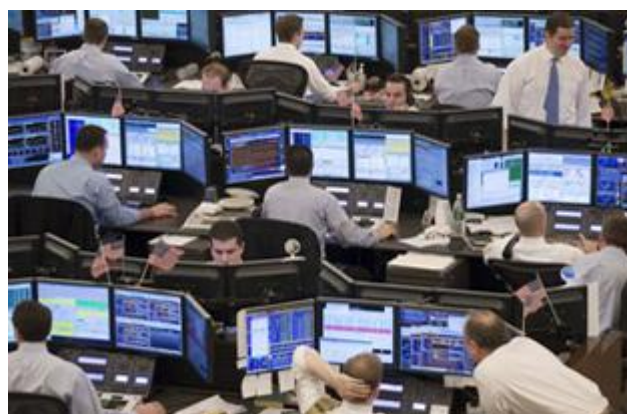
Foreign exchange traders

The Financial Transaction Tax (FTT) is now a widely discussed policy option that would generate substantial new revenue from the financial sector. The costs of the crisis have been huge, as of the end of December 2009 the amount spent on bank bail-outs by advanced G-20 economies was equivalent to 6.2% of world GDP – $1,976 billion (IMF, 2010). Yet in Europe and the US, it has been ordinary citizens, with no responsibility for creating the crisis who have borne the costs with job losses and cuts to public services.